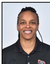
DIR. PLAYER DEVELOPMENT TERESA WEATHERSPOON FIRST SEASON