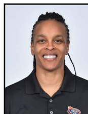
DIR. PLAYER DEVELOPMENT TERESA WEATHERSPOON FIRST SEASON